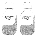
Two bottles of CLENPIQ (5.4 oz each)